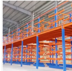
Cantilever Racking System