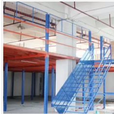
Warehouse Mezzanine Floor