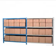
Light Duty Racking System