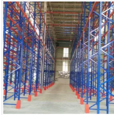
High Single Deep Pallet Rack